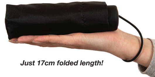
Just 17cm folded length!

The protective case can also be printed on ONE side for an extra cost. See the Surcharges page on our website for pricing.