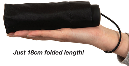
Just 18cm folded length!