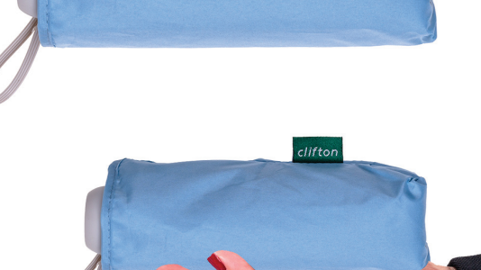
Just 16.5cm folded length!