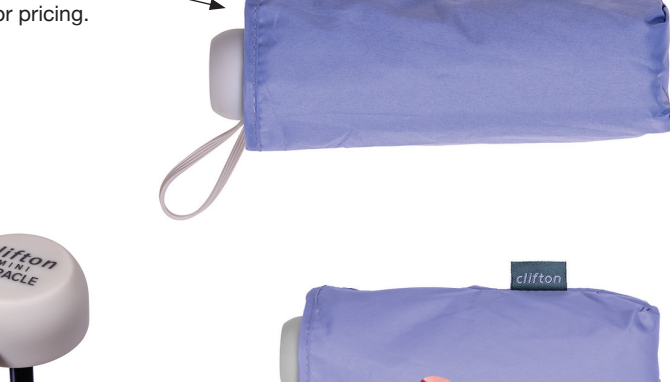
Just 16.5cm folded length!